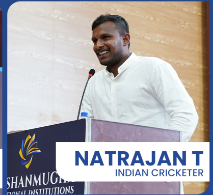
NATRAJAN T INDIAN CRICKETER