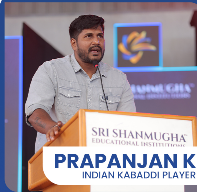
PRAPANJAN K INDIAN KABADDI PLAYER